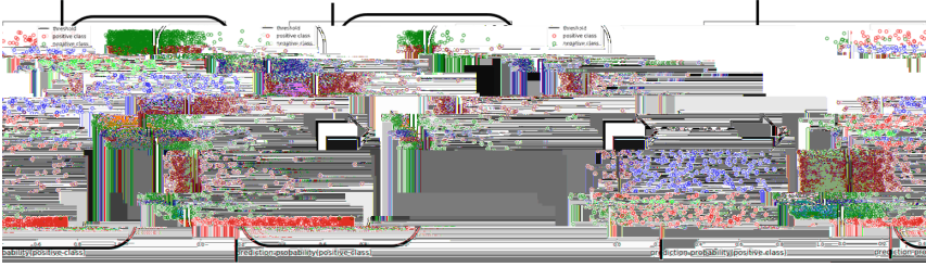
Fig. 1. The black vertical line represents the threshold in each classification. In the black box, all instances can be predicted by the next classifier.

where, T is the number of all iterations, I^{(T)} is the instances index set in the T^{\text{th}} iteration and y_i^{(T)} is prediction of \mathbf{x}_i in the T^{\text{th}} iteration. This criterion means that the last prediction which is positive can be predicted positive. Figure 1 shows the process of prediction.